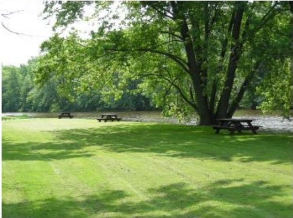
EHLERS COUNTY PARK MAP