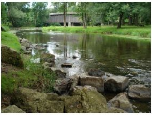
COVERED BRIDGE COUNTY PARK MAP