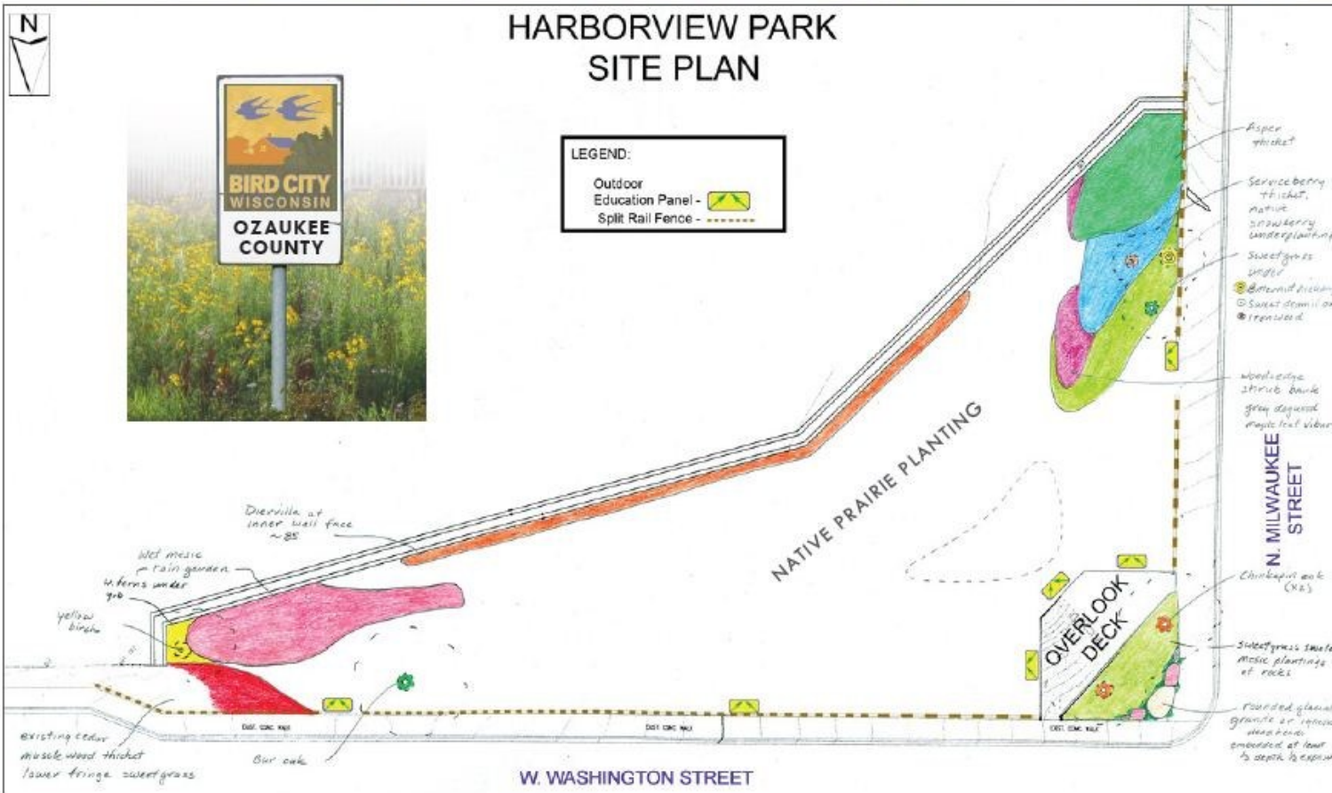
HARBORVIEW COUNTY PARK MAP